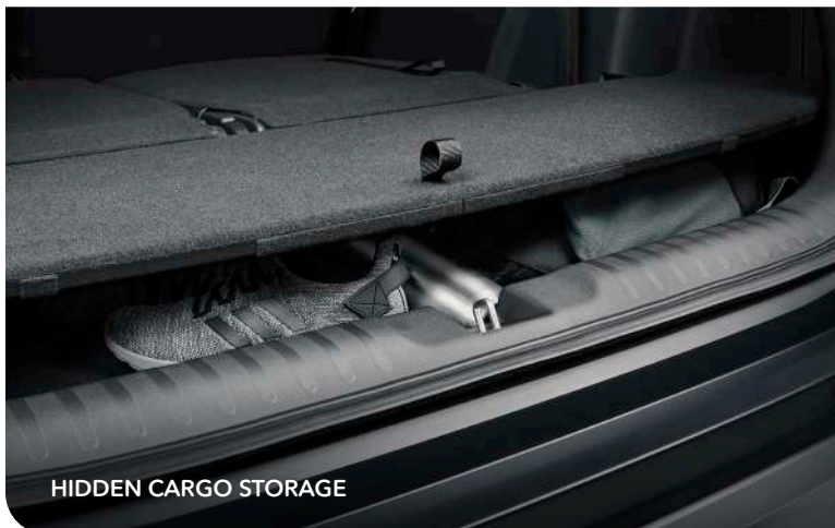
HIDDEN CARGO STORAGE