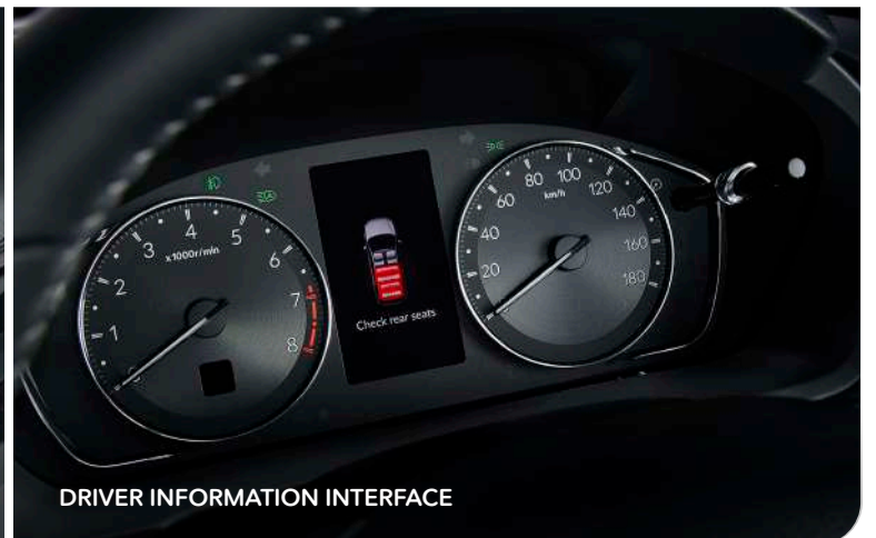
DRIVER INFORMATION INTERFACE